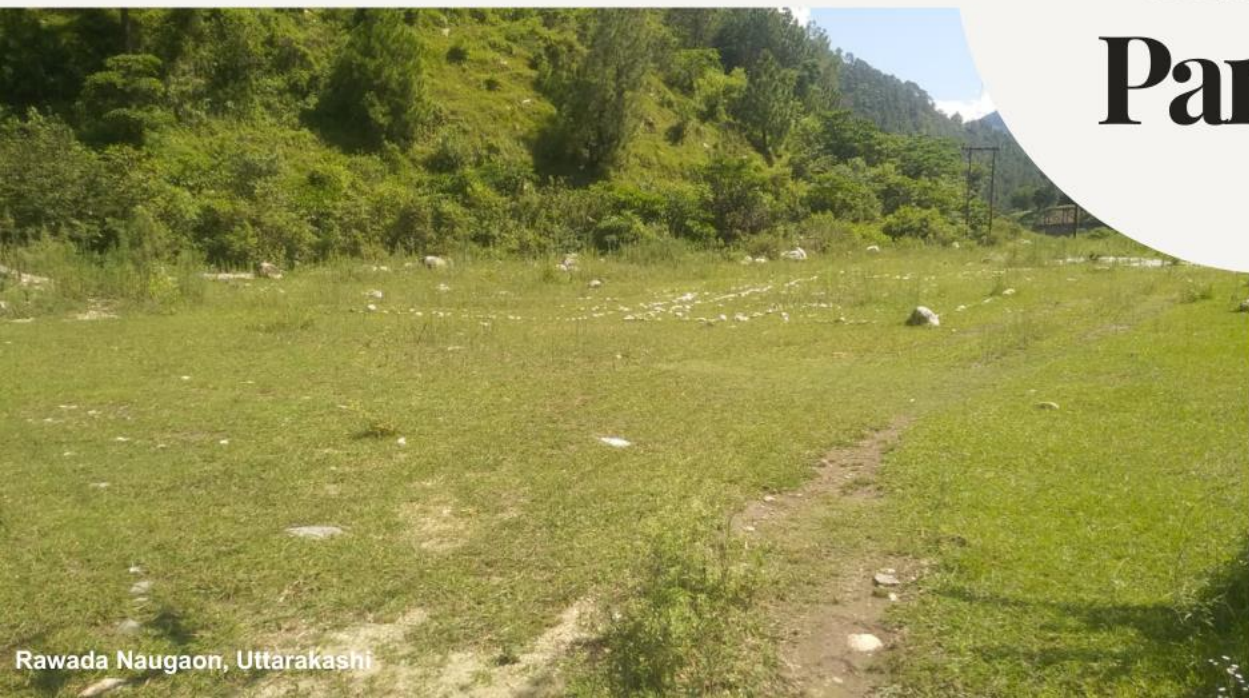
Rawada Naugaon, Uttarakashi