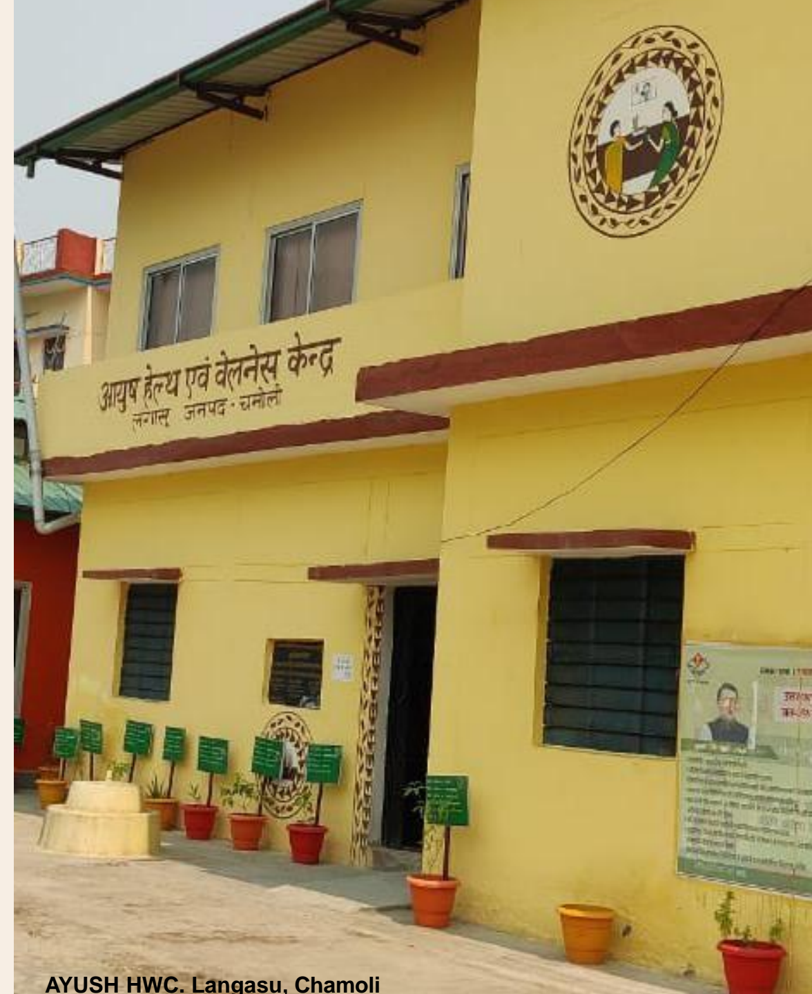
AYUSH HWC. Langasu, Chamoli